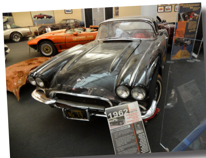
1962 Corvette on display before restoration at National Corvette Museum