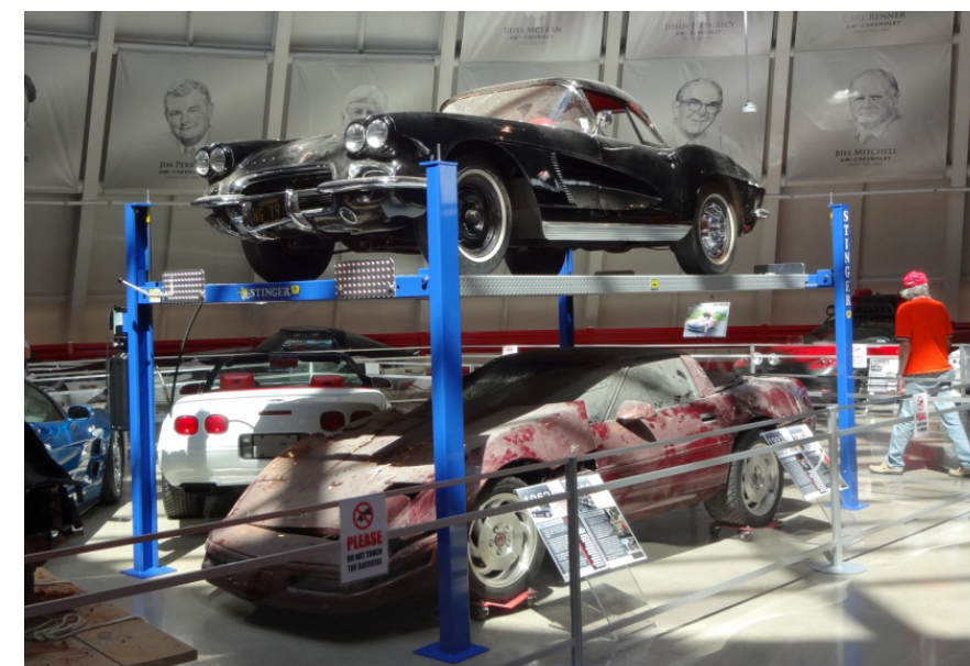
1962 Corvette displayed with 7 'sinkhole' Corvettes in National Corvette Museum's Skydome