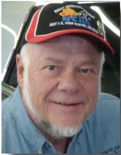
Merchandise By Eckhard Pobuda

Winter is on its way. Lots of nice warm RMC jackets available. We now have most sizes of the heather gray ring spun t-shirts, blue silk touch polo shirts, royal blue sweatshirts, gray sweatshirts with embroidered logos. This includes: Heather Charcoal Ring Spun Short Sleeve T-Shirts (Pic 1); Black Heather Silk Touch Long Sleeve T-Shirts (Pic 2); Blue Silk Touch Short Sleeve Polo Shirts (Pic 3); Royal Blue Long Sleeve Sweatshirts (Pic 4). All of this merchandise is available in all sizes. Also, we have replenished the inventory of several of our popular items such as the Chambray Shirts with embroidered pockets and Black Short Sleeve T-Shirts with embroidered pockets. Prices are shown in the attached Merchandise Inventory.