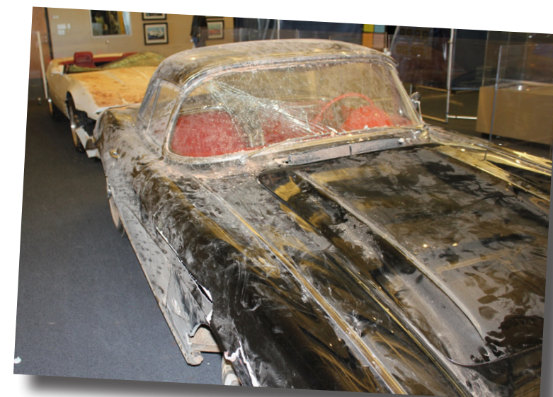
1962 Corvette after removal from National Corvette Museum's sinkhole

Now the '62 Corvette has joined the other 7 sinkhole Corvettes in the Museum Skydome. The 1 millionth Corvette and the 2009 ZR1 were restored, and the remaining 5 are exhibited just 'as removed' from the sinkhole. When you visit NCM, enjoy taking extra time to view these Great Eight cars... especially now that you know the story of the '62!