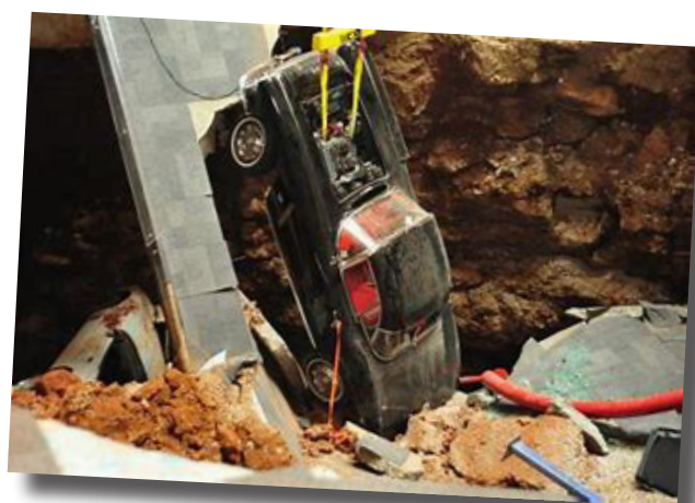
1962 Corvette removed from National Corvette Museum's sinkhole

Almost seven years ago, a 65' x 45' sinkhole opened in the Museum's Skydome, taking eight prized Corvettes with it. The 1962 Tuxedo Black Corvette was restored and was "revealed" on the 4 th sinkhole anniversary, February 12, 2018. I thought you might be interested in the story behind this Corvette and its restoration.