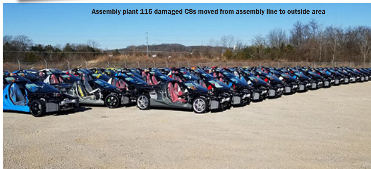
Assembly plant 115 damaged C8s moved from assembly line to outside area

It was initially reported that approximately 120 brand new Stingrays inside the factory were damaged beyond repair. GM reports that 115 C8s were driven from the plant assembly line and parked outside. GM, not taking any chances, will destroy any Corvette showing damage