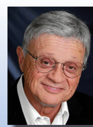
Judging Chair