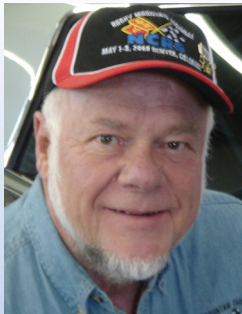
Merchandise By Eckhard Pobuda

Winter is on its way. Lots of nice warm RMC jackets available.