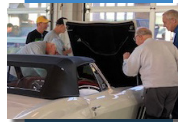
Photos of fall chapter judging meet