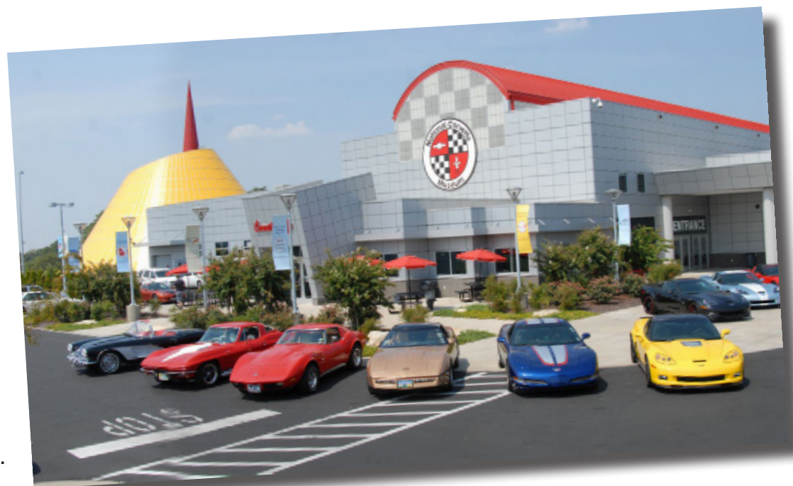
NCM - National Corvette Museum