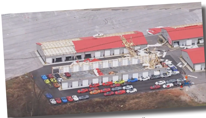
MSP's garages and C8 storage area prior to R8C delivery