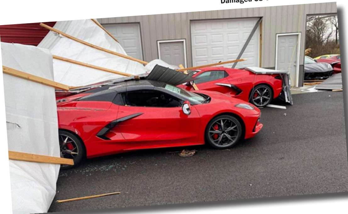
Damaged C8 Corvettes at MSP