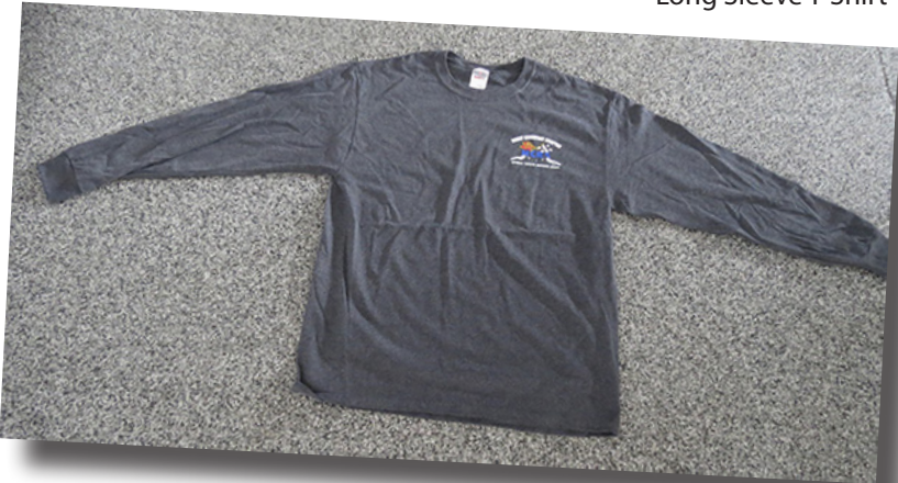
Long Sleeve T-Shirt