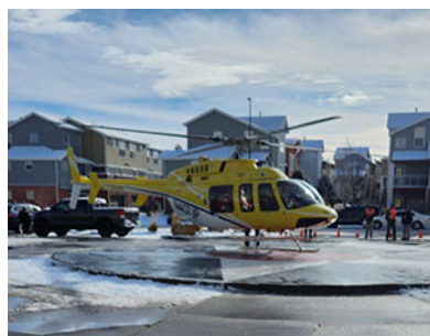
During the chapter visit to Lowrey Air museum last December, Jack Humphrey snapped a picture of Santa's arrival by helicopter.