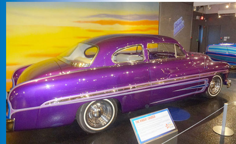
Carl Casper's 1951 Mercury "Knight Cruiser"

Casper sought to conquer the dragstrip in addition to creating show cars. He built four dragsters including the Young American, a champion that held numerous NHRA and AHRA records in 1970 and 1971. Carl handled the design and gave the Young American the red, white, and blue paint theme and upholstery. The dragster was powered by a super 426 hemi with a 671 GMC supercharger, Cragar blower drive, Enderle fuel injection, Cyclone headers, and a Mallory magneto igniti