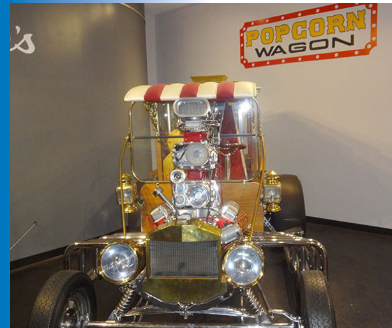
Carl Casper's "Popcorn Wagon"

The Knight Cruiser, a sensational full custom "all metal" 1951 Mercury is just one of the many examples of the true, genuine 1950's era street cruisers. Carl added three Rochester two-barrel carburetors to the engine. He painted the car himself with purple candy color, highlighting all the custom work with his striking, multi-colored scallops, making Casper's Knight Cruiser a stunning example of the Custom Car era.