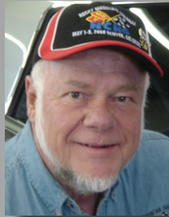
Merchandise By Eckhard Pobuda

We now have most sizes of the heather gray ring spun t-shirts, blue silk touch polo shirts, royal blue sweatshirts, gray sweatshirts with embroidered logos. This includes: Heather Charcoal Ring Spun Short Sleeve T-Shirts (Pic 1); Black Heather Silk Touch Long Sleeve T-Shirts (Pic 2); Blue Silk Touch Short Sleeve Polo Shirts (Pic 3); Royal Blue Long Sleeve Sweatshirts (Pic 4). All of this merchandise is available in all sizes. Also, we have replenished the inventory of several of our popular items such as the Chambray Shirts with embroidered pockets and Black Short Sleeve T-Shirts with embroidered pockets. Prices are shown in the attached Merchandise Inventory.