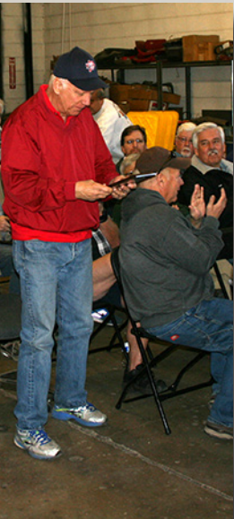
ceiving a partici- r outgoing board