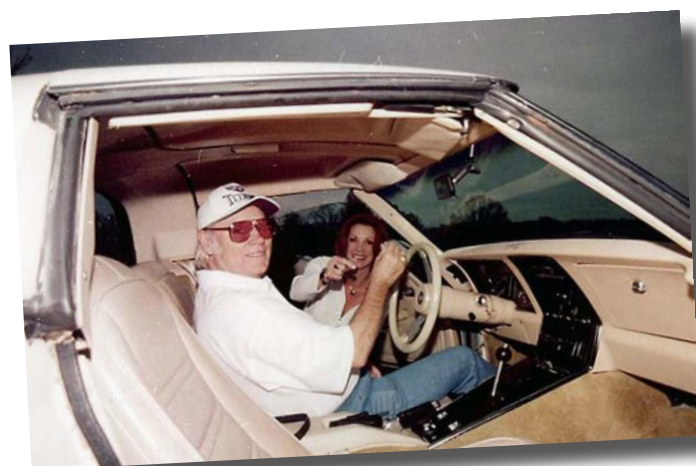
George Jones 1978 Corvette

Loved Back Then (The Corvette Song). When asked if owning a Corvette affected his decision to cut The Corvette Song, Jones said Oh, absolutely! George Jones' car is the first celebrity-owned Corvette now permanently displayed the National Corvette Museum.