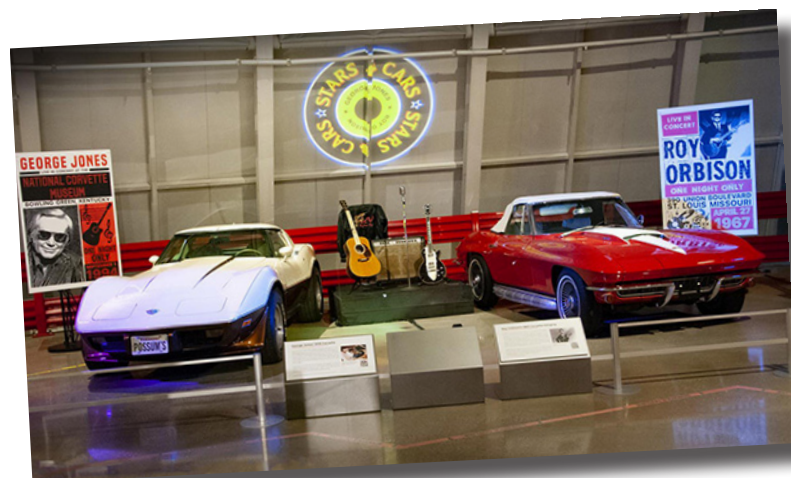
George Jones and Roy Orbison's Corvettes "STARS AND CARS" Exhibit

is also a car that celebrities own, love and drive.