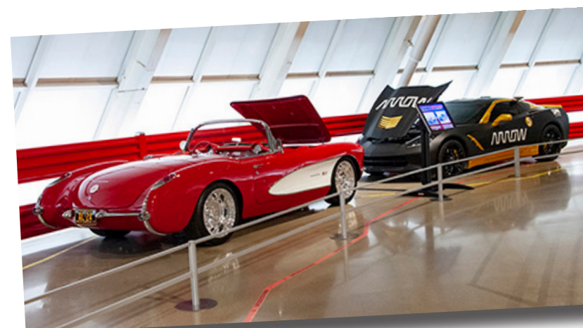
Red 1957 Restomod and 2014 SAM Arrow Corvette in NCM Skydome