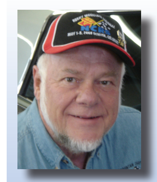
Merchandise By Eckhard Pobuda

We now have most sizes of the heather gray ring spun t-shirts, blue silk touch polo shirts, royal blue sweatshirts, gray sweatshirts with embroidered logos. This includes: Heather Charcoal Ring Spun Short Sleeve T-Shirts (Pic 1); Black Heather Silk Touch Long Sleeve T-Shirts (Pic 2); Blue Silk Touch Short Sleeve Polo Shirts (Pic 3); Royal Blue Long Sleeve Sweatshirts (Pic 4). All of this merchandise is available in all sizes. Also, we have replenished the inventory of several of our popular items such as the Chambray Shirts with embroidered pockets and Black Short Sleeve T-Shirts with embroidered pockets. Prices are shown in the attached Merchandise Inventory.