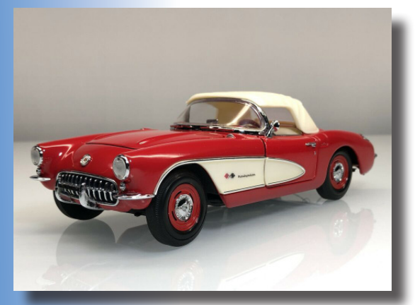
Sample file model car..not Fred's. ED

Fellow Members: I have 20 1/24th scale Corvette models from the Franklin and Danberry Mint I am selling. I will bring them to the swap meet. All models are mint. All are in original shipping materials with liturature, except the 1953 model. Wholesale was $100. Selling each for $50.