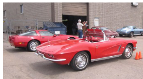
C1 and C4 used for PV judging school last April at Corvette City.