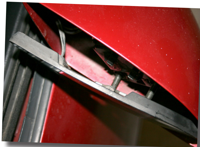
Mirror pic.1, see page 4