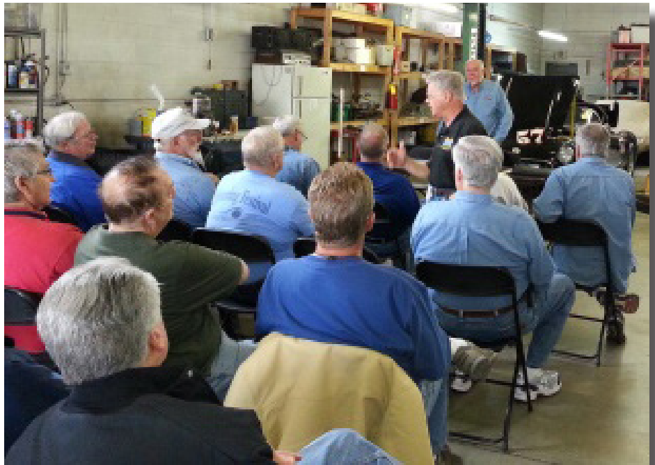
Judging School on April 19 at Corvette City; performance Verification (PV) judging. We had a C1, C2 and C4 [ED]