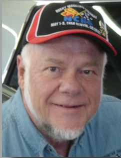
Merchandise By Eckhard Pobuda

We now have most sizes of the heather gray ring spun t-shirts, blue silk touch polo shirts, royal blue sweatshirts, gray sweatshirts with embroidered logos. This includes: Heather Charcoal Ring Spun Short Sleeve T-Shirts (Pic 1); Black Heather Silk Touch Long Sleeve T-Shirts (Pic 2); Blue Silk Touch Short Sleeve Polo Shirts (Pic 3); Royal Blue Long Sleeve Sweatshirts (Pic 4). All of this merchandise is available in all sizes. Also, we have replenished the inventory of several of our popular items such as the Chambray Shirts with embroidered pockets and Black Short Sleeve T-Shirts with embroidered pockets. Prices are shown in the attached Merchandise Inventory.