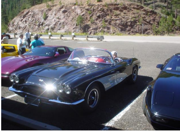
"Dream on buddy"