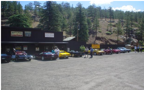
At 10:45am, waiting for the liquor store to open

You will notice that the next NCRS BOD will be on Friday after the National Convention in St. Charles. If you wish to attend, it is open to all members.