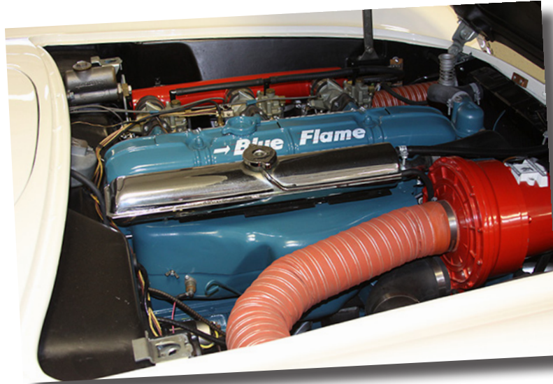
Supercharged Blue Flame Six

60 mph in just 3.5 seconds and was a car you could head to the golf course in with two golf bags stowed in the back. On a side note, for those of us that went to the Novi National in 2011 and toured Ken Lingenfelter's car collection, we got to see a supercharged Blue Flame Six '54 Corvette test mule that Zora did some experimenting with, so technically there were earlier than C6 supercharged Corvettes, but not a production based Corvette. So that leads us to the C7 ZR1, which will set the performance bar a notch or two higher than the current Z06 and also a higher sticker price, but likely not much more than one of the C3 ZR1s if you could find one. So stay tuned to see what Chevrolet comes up with to keep the ZR1 nameplate as the pinnacle of Corvette performance.