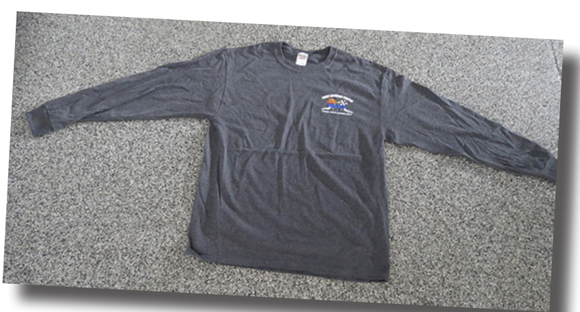
Long Sleeve T-Shirt