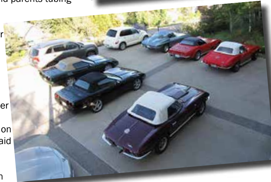
Members cars parked for the occasion.