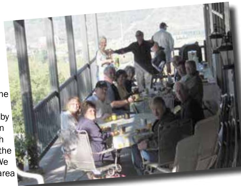
Top and bottom left: Relaxing at the Reiff's in Steamboat.