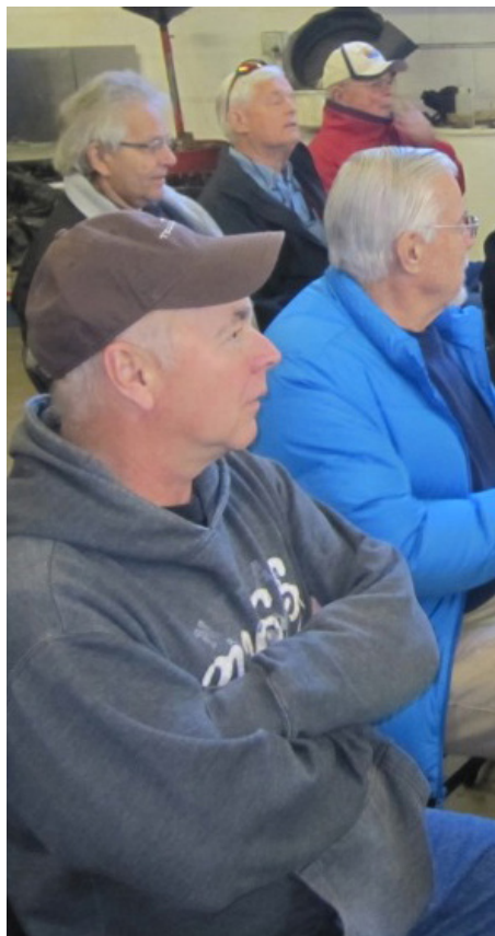
November tech session attendees at Corvete City.