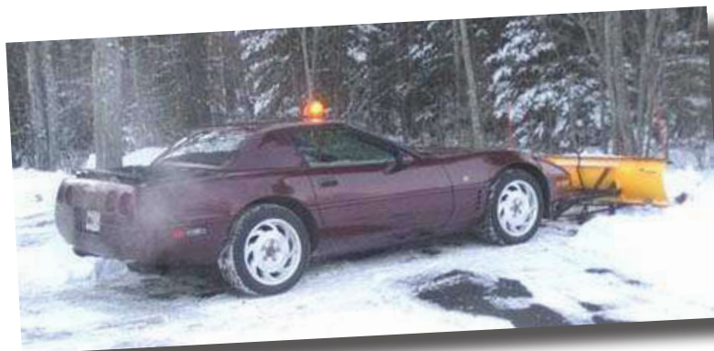
Corvette Snow Plow