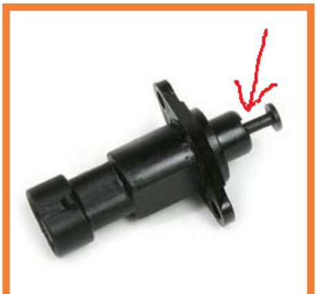
C4 Door Jam Switch

I think I will just go to work on the windshield wiper motor for my C2 instead.