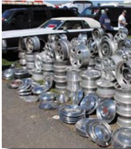
Swap meet stock photo.