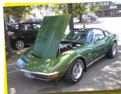
For Sale 4/19

There has been a lot more activity in the FOR SALE department, so I had to give it more space than the back of the newsletter. We will see how it develops and I may