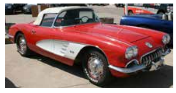
Dealer Day at Ed Bosarth Chevrolet

Owners cars are listed starting left row top to bottom, then left to right (ED).