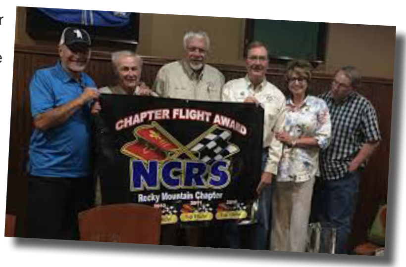
This picture is from a previous year flight award presentation. ED