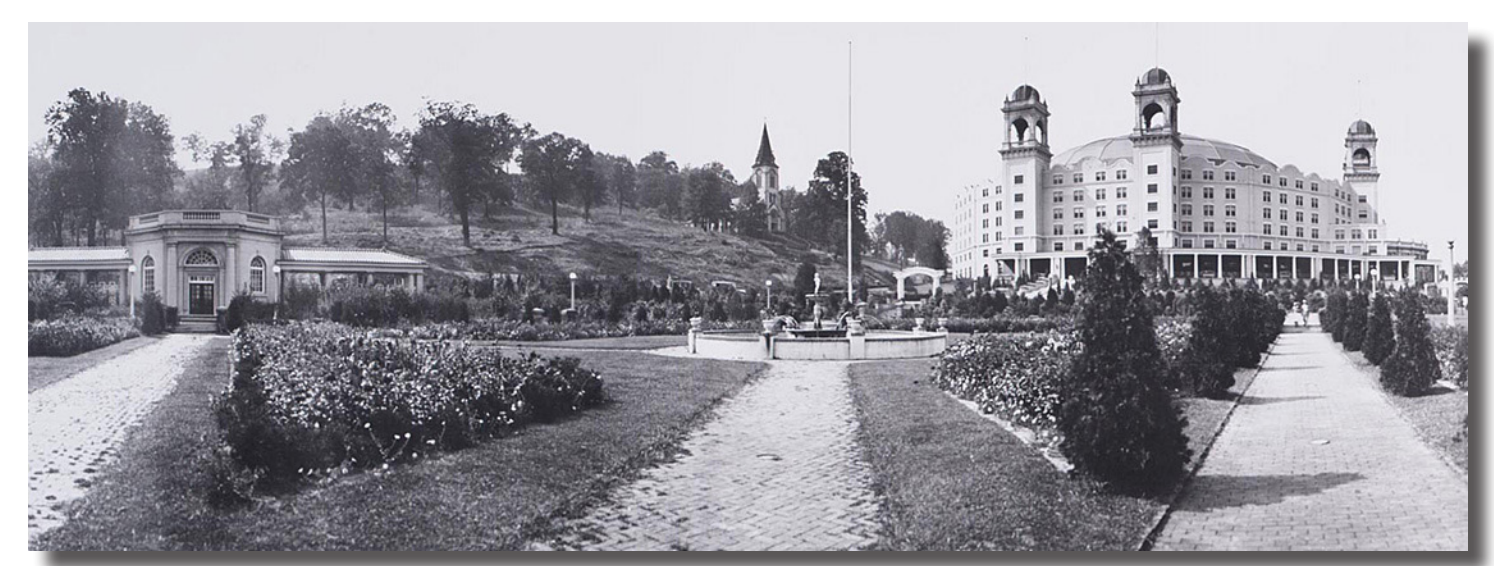
Hisotical photo of French Licck resort. ED