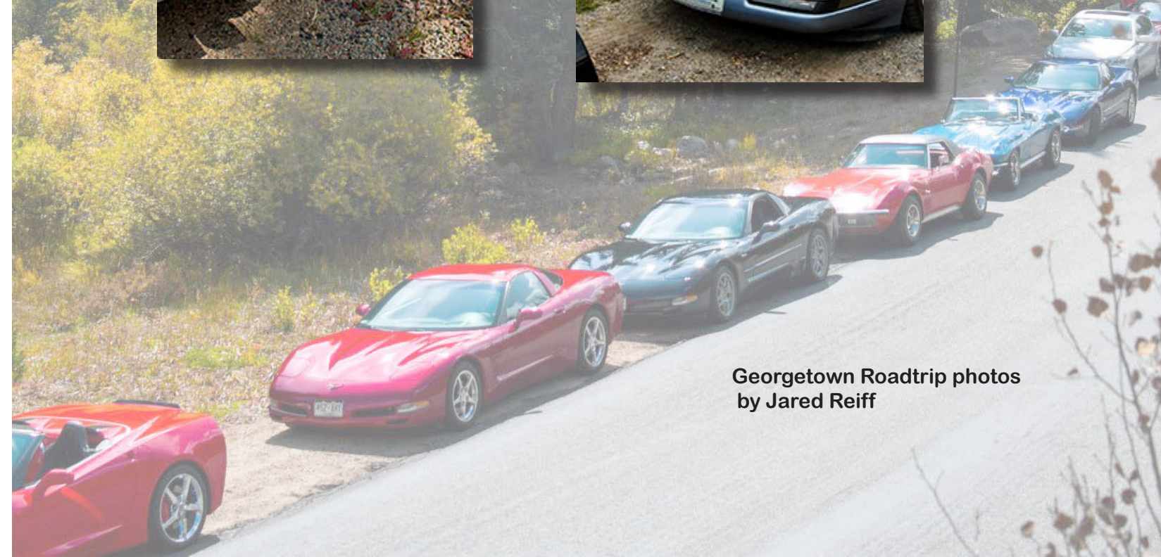
Georgetown Roadtrip