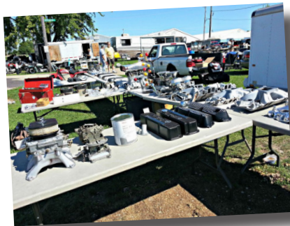
Swap meet stock photo.. ED

In October we will have a swap meet at Corvette City.